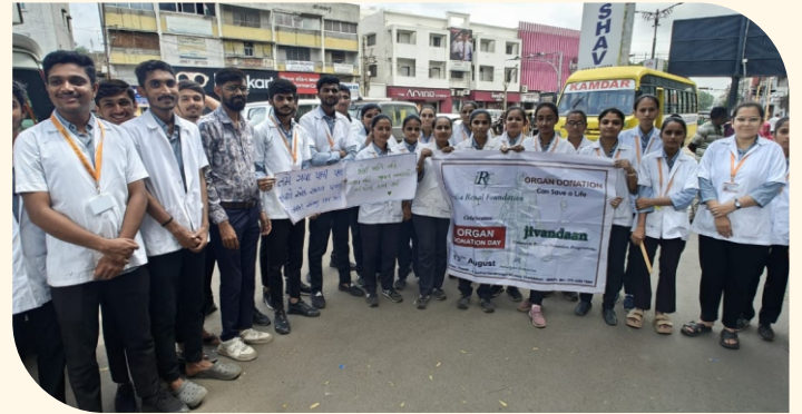
Organ Donation Awareness Rally, Rajkot

Another organ donation awareness rally was organized in Rajkot city with the participation of students of Kamdar Nursing College from Citizen Bank Chowk to Trikonbagh in which students tried to create awareness about organ donation through Playcard.