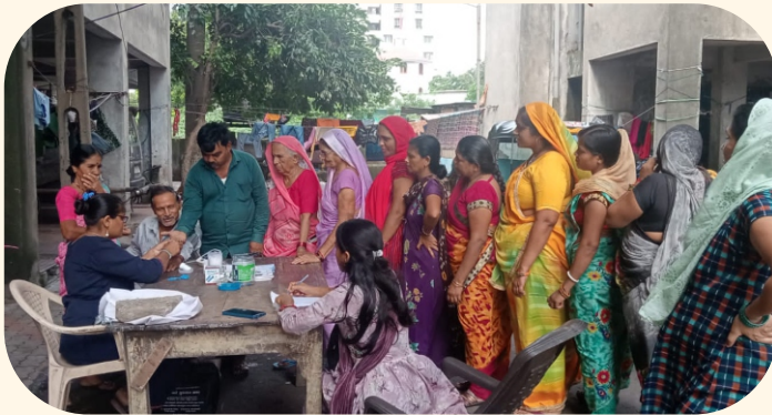
Siddharth Nagar, Surat