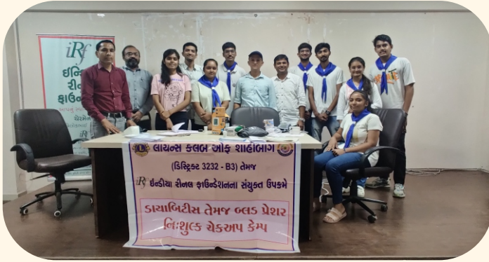
R.C Technical College, Ahmedabad