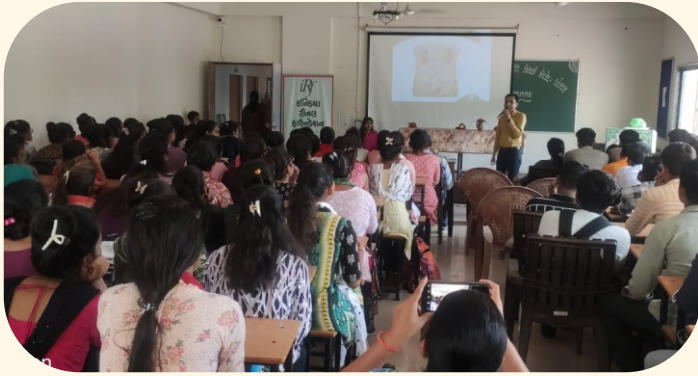
Dholka Education Trust, Dholka, Ahmedabad