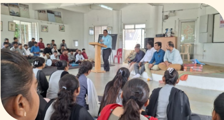
Organ Donation Awareness Program at DIET, Bhavnagar