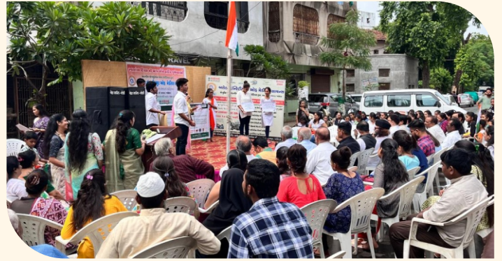
During the Independence Day celebrations, the audience was made aware about organ donation

During Independence Day celebrations at Baroda Institute of Medical Sciences (BIMS) on August 15, an awareness program was conducted, where dignitaries and students pledged to donate their organs.