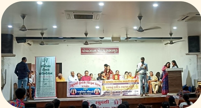
Kotak School, Rajkot