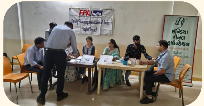
Rolex Rings Limited, Rajkot