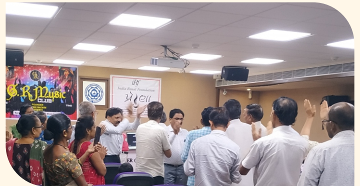
Prerana Program, Surat