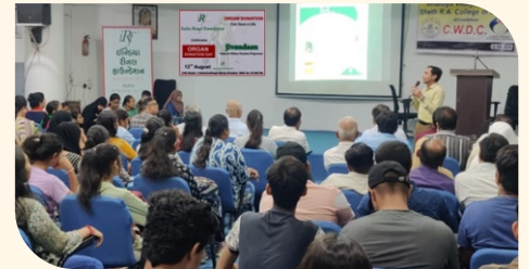
Sheth R.A Bhawans College, Ahmedabad