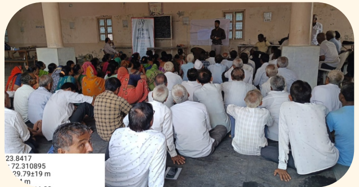
Amudh Village, Ta.Unjha, Dist. Mahesana