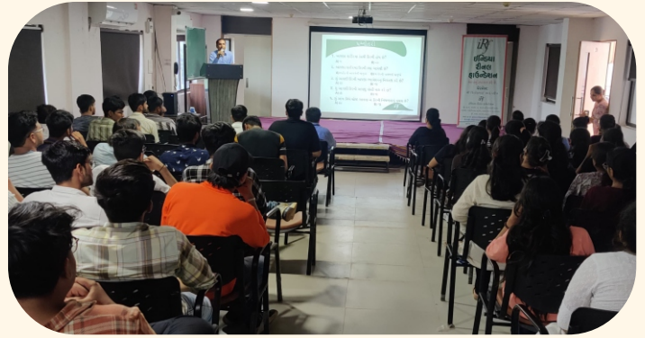
Saraswati Institute of Pharmaceutical Sciences, Gandhinagar