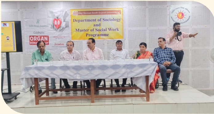
Organ Donation Awareness Programme, Surat