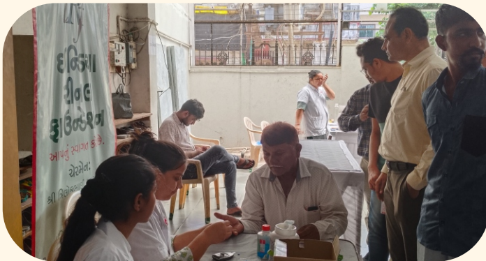
Diamond office, Bhavnagar