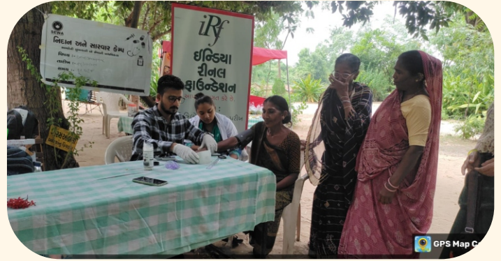
Ganeshpura Village, TA - Kadi, Dist - Mahesana