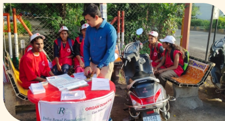
Volunteers filling up organ donation pledge forms